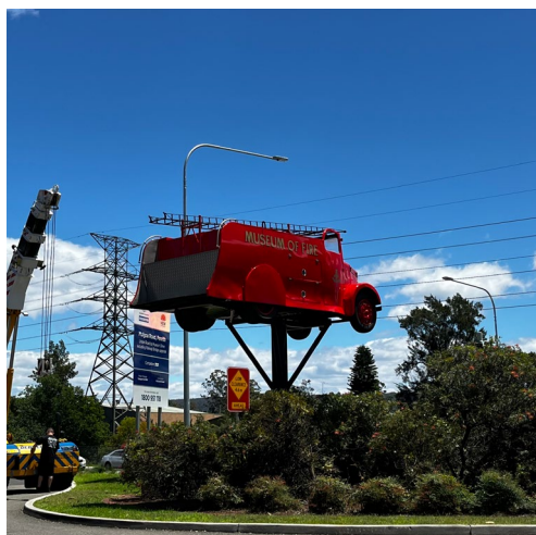
Castlereagh Road entrance

The Penrith Railway station is located directly behind the Museum and is a 500 metre walk (approximately 5 minutes) from the platform to the Museum's side entry gate. Follow signs to Penrith North from the station and walk towards the multistory station carpark. The pedestrian gate is located on Combewood Avenue.