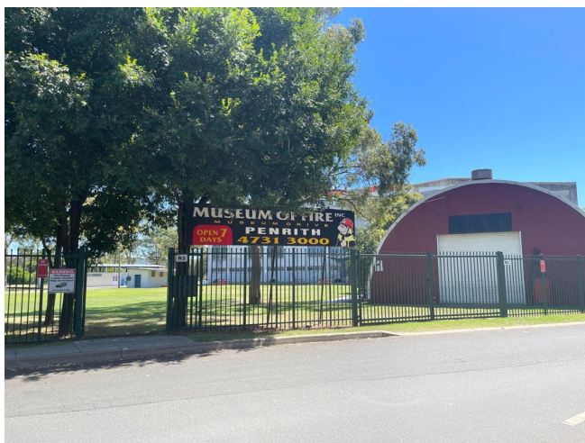
Pedestrian access from Combewood Avenue