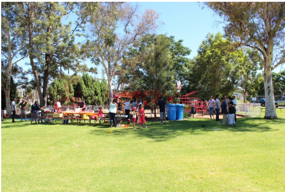
Picnic Facilities and Playground

The Museum is a registered charity, and the grounds are maintained by volunteers – so your consideration would be greatly appreciated.