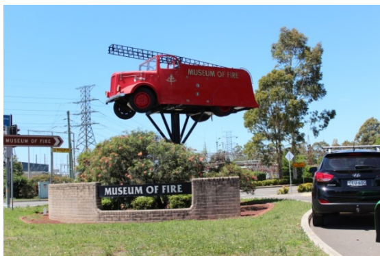
Museum entry from Mulgoa Road

By Train: From Central - Catch the T1 Western or Blue Mountain line to Penrith Station. At Penrith Station, exit via the overhead walk-way to the north side, heading towards the car park (on the opposite side to Westfield). It is then just a short three minute walk along the access road to the Museum of Fire.