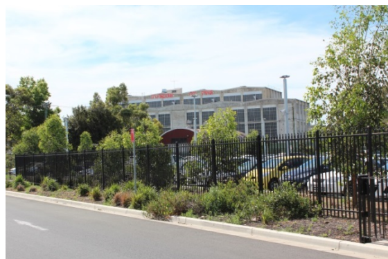
Museum entry from Penrith Train Station