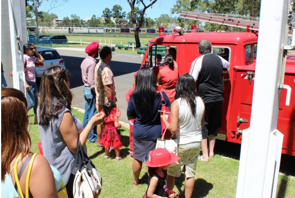
Fire Engine Ride

Most children dream of growing up to be a firefighter, so why not grant their wish? A Junior Firefighter's Birthday Party at the Museum of Fire is the perfect, affordable and enjoyable option at only $11 per person. A firefighter party is easy to put together, and suitable for all ages.