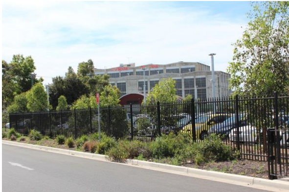
Museum entry from Penrith Train Station

We are open 9:30am to 4:30pm seven days a week. Excluding the following public holidays: Good Friday, Christmas Day, Boxing Day, and New Year.