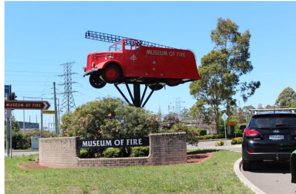
Museum entry from Mulgoa Road

By Road: From the M4 Motorway, take the Mulgoa Road (Rte14/73) exit towards Penrith, then follow Tourist Drive #14 north along Mulgoa Road & Castereagh Road. The entrance is located 1km north of the Panthers Entertainment Centre. The entrance is on the right, 50m north of the railway underpass bridge. The entrance can be easily identified by a 1942 Dennis Fire engine that is raised 4m off the ground!